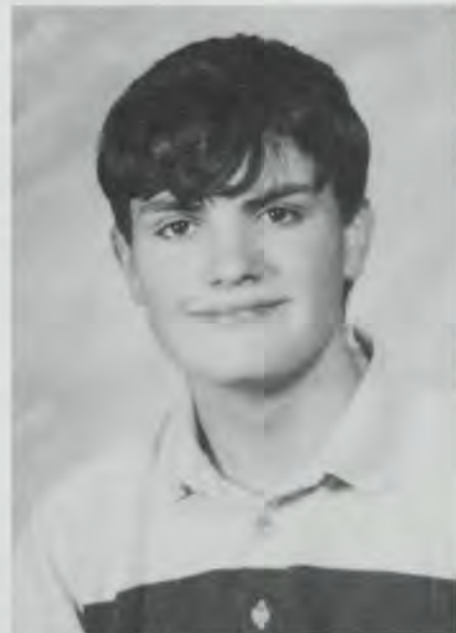
The class of '65 has been challenged to guess the identity of this 15-year-old. Answers should be directed to the phone number in their class notes.