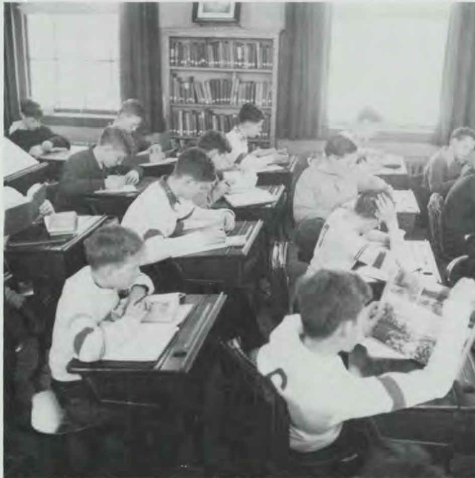
Classroom at PCD in January 1948.