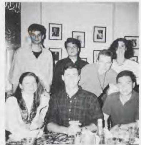
The class of '88 had a good turnout for its fifth reunion last May.